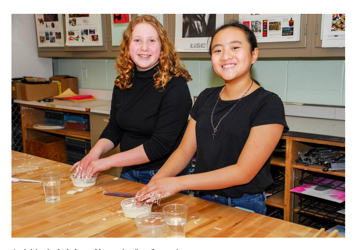
Activities included non-Newtonian "goo" experiments.