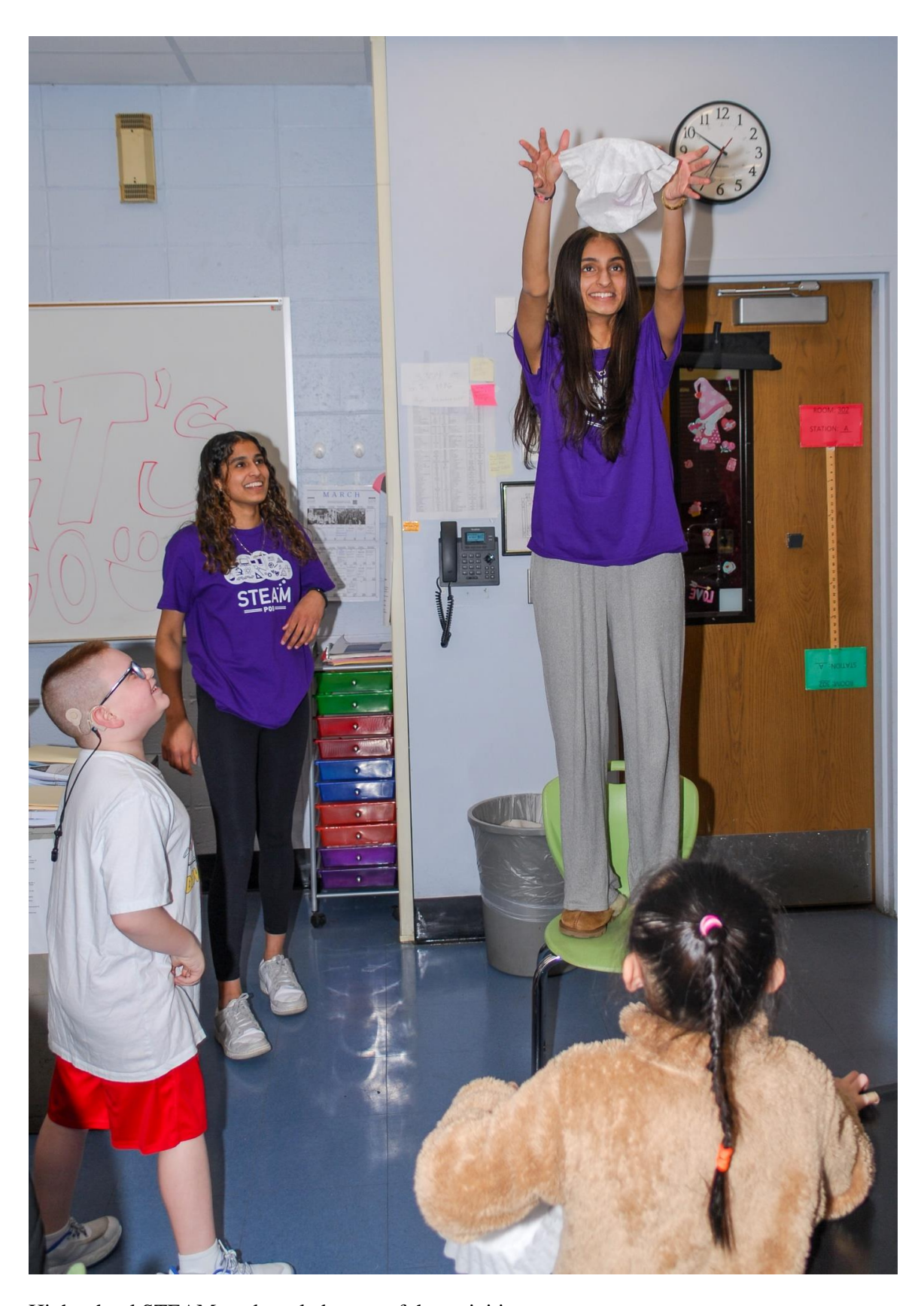
High school STEAM students led many of the activities.